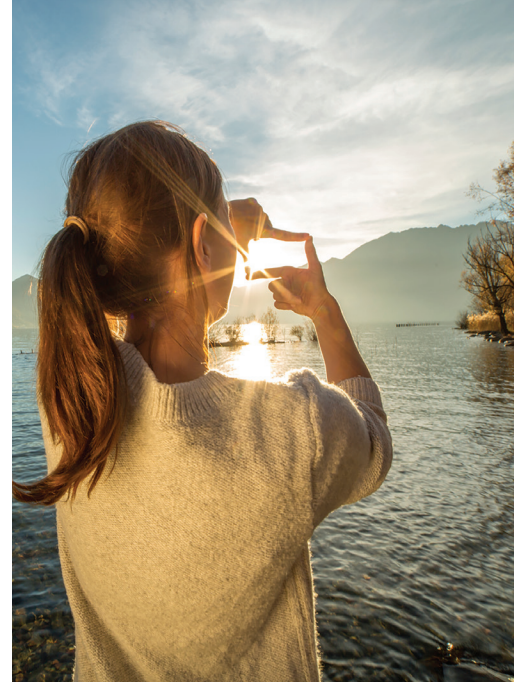
Left:  Right: